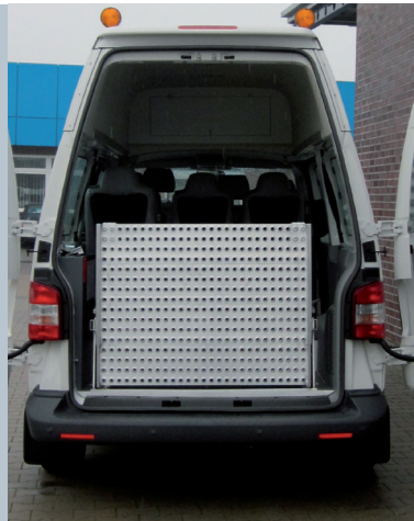
Vehicle with folded ramp. Rear view is maintained.