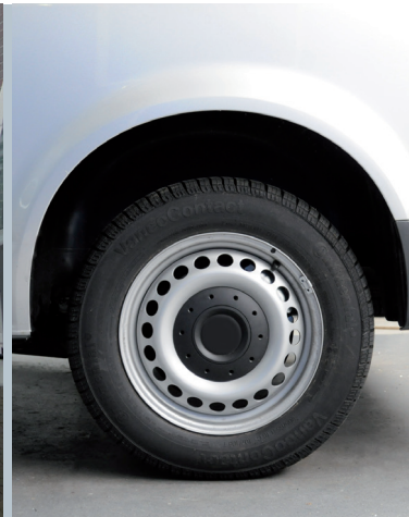
Vehicle ready for departure (standard height).