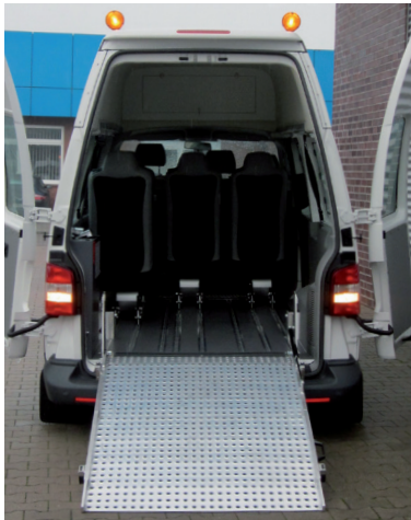
The lowered vehicle can be accessed by the wheelchair.